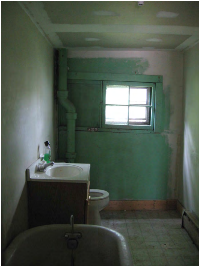
bathroom, first floor