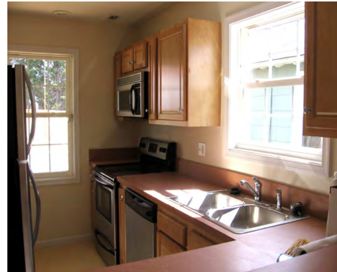
Energy Star appliances, Marmoleum flooring