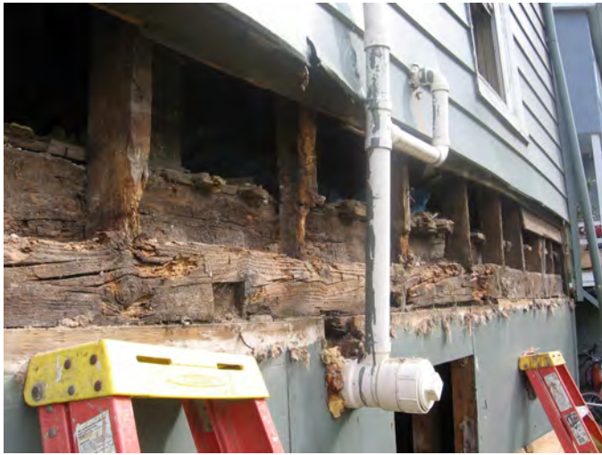
water damage, west wall