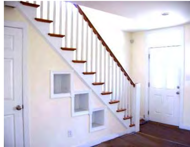
refinished heart pine flooring, Pella fiberglass entry