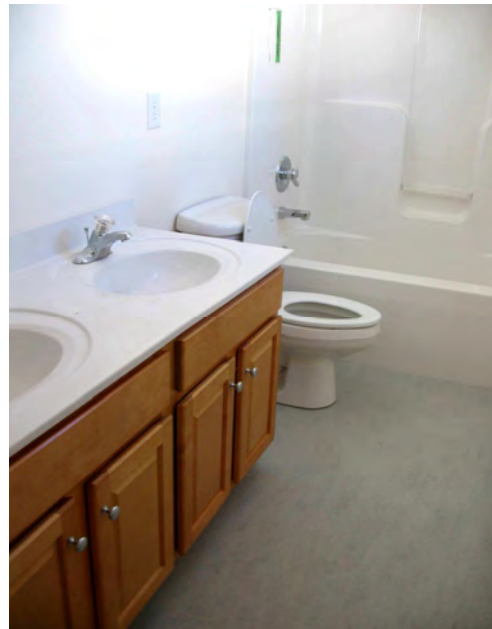
low flow faucets and toilet, Marmoleum flooring