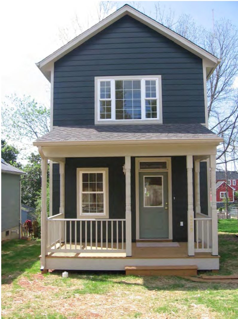
Hardiplank siding, thermal pane windows, 35 yr shingles