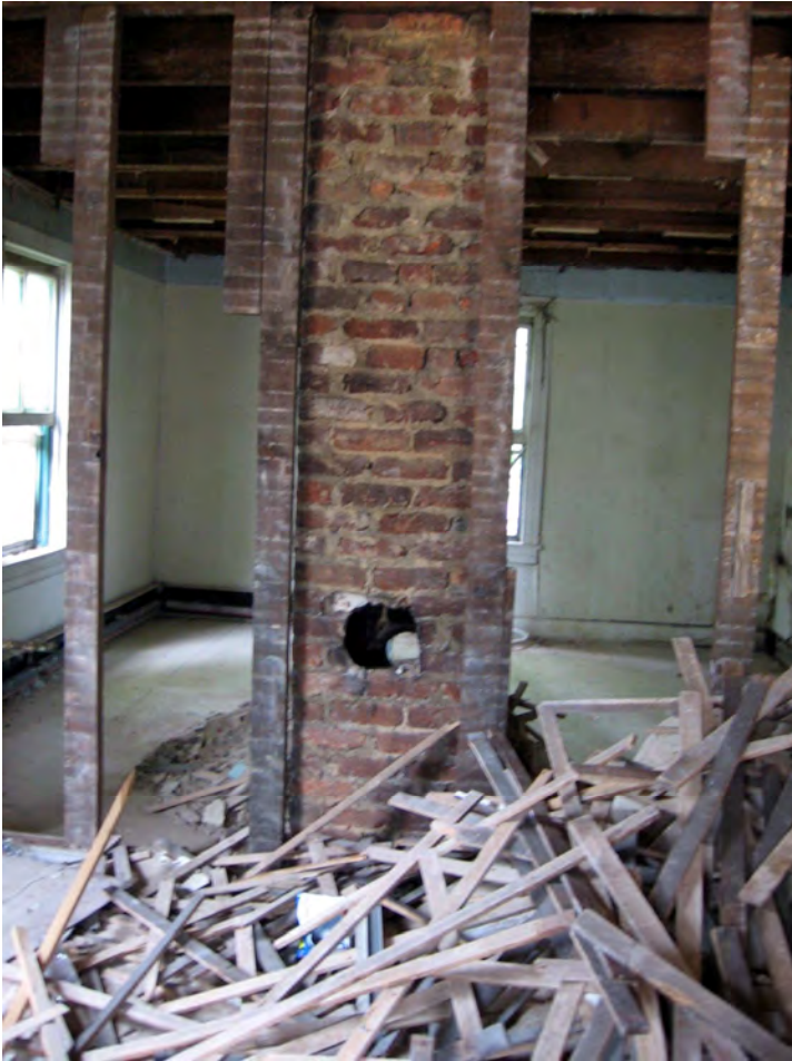
second floor, rehab work begun