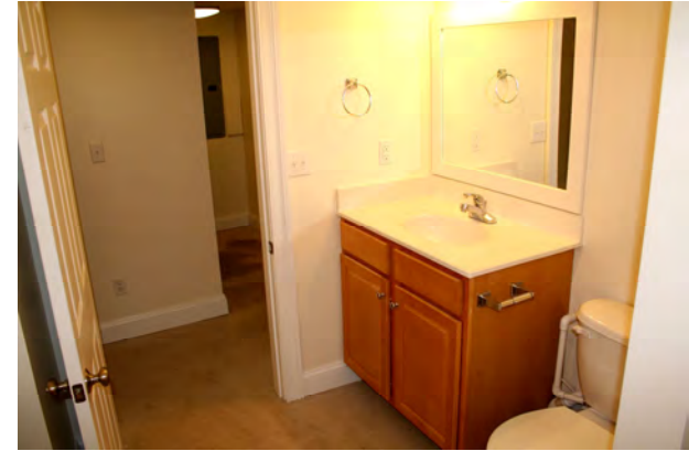
basement half bath, low flow toilet, faucets, laundry