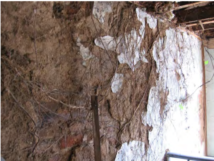
interior wall, second floor