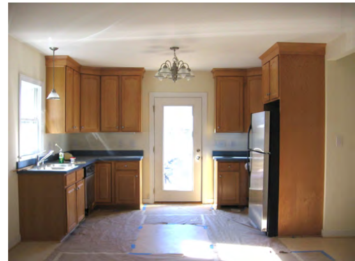
all wood cabinets, low flow faucet