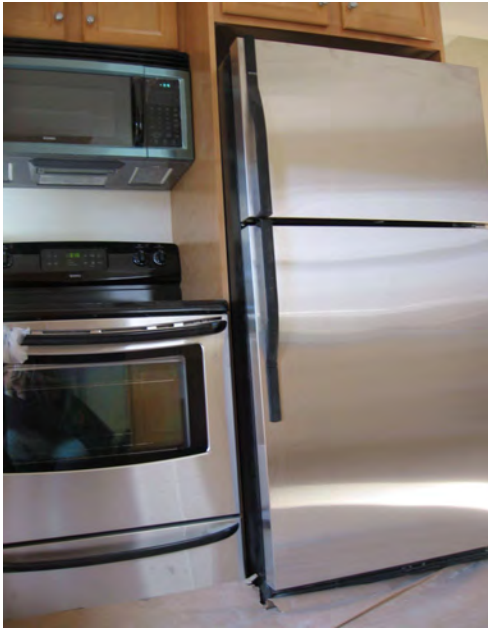
all new, Energy Star appliances