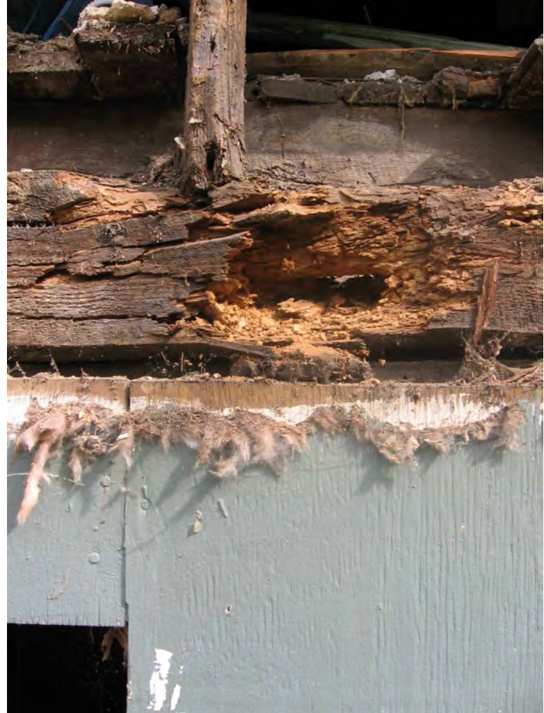
water-damaged stud and beam, detail