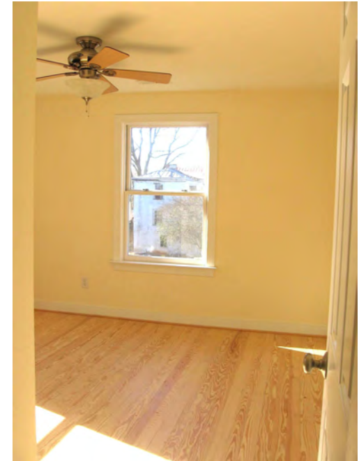
bedrooms with wood floors and fans