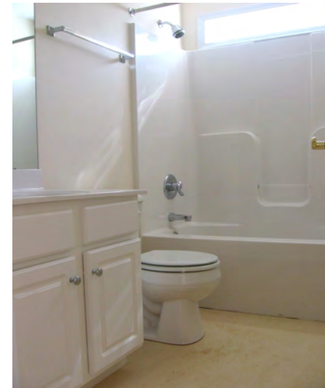
low flow faucets and toilet, Marmoleum flooring