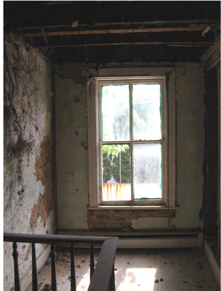
window, second floor