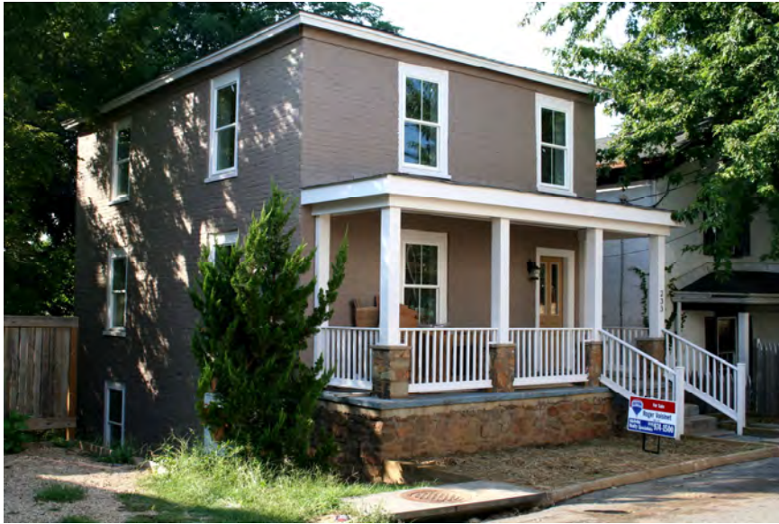
brick pointed, sealed and painted, new thermal pane windows