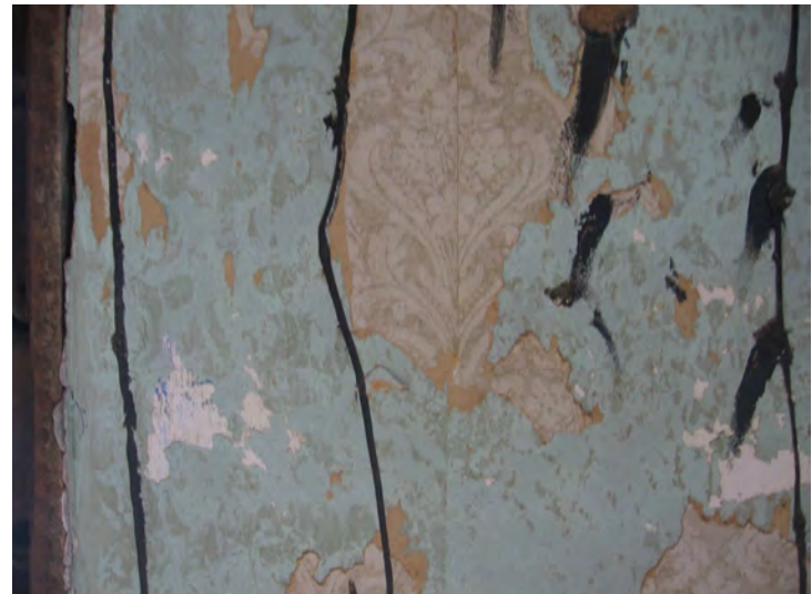
bedroom wallpaper, second floor