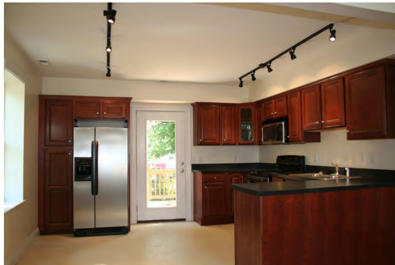
Energy Star appliances, all wood cabinets, Marmoleum flooring