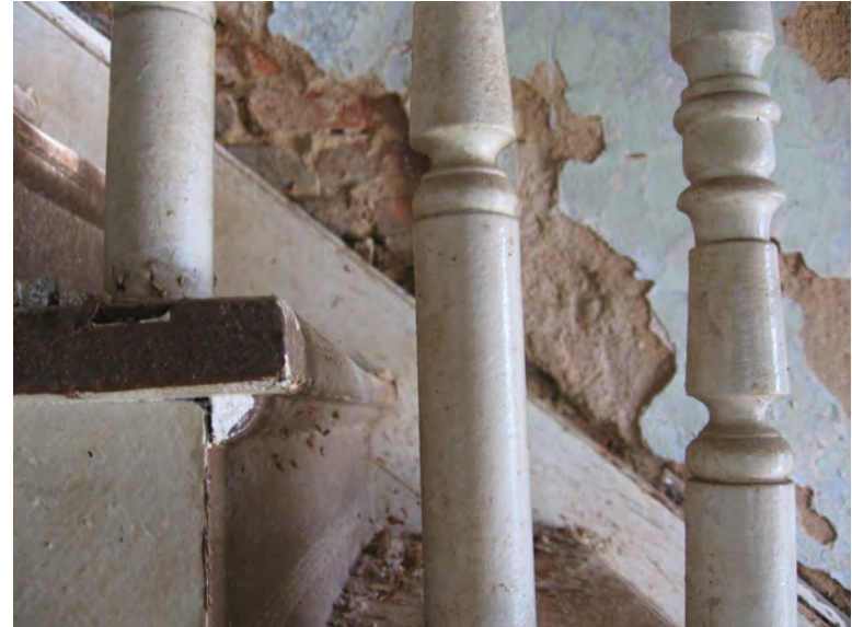
stair and interior wall