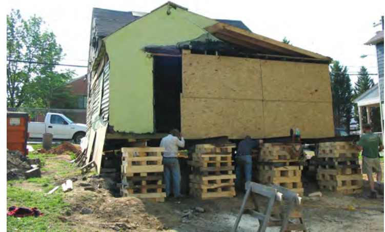
raising and reframing the historic Smith-Reaves house