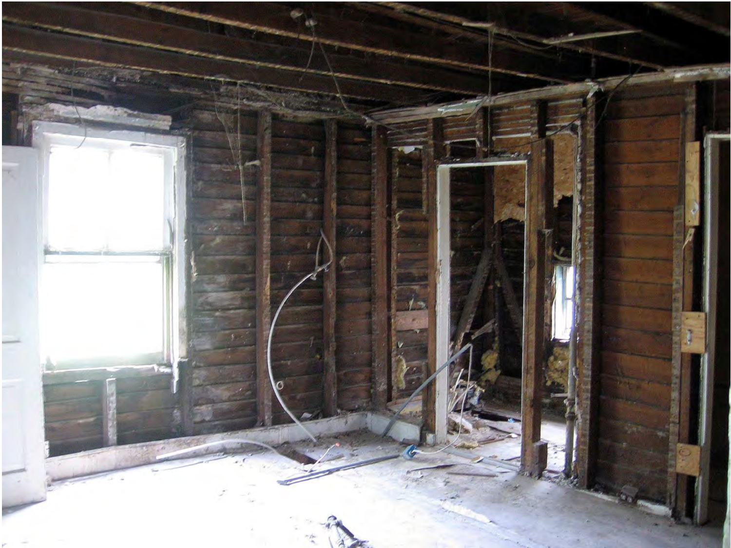
second floor, rehab work begun